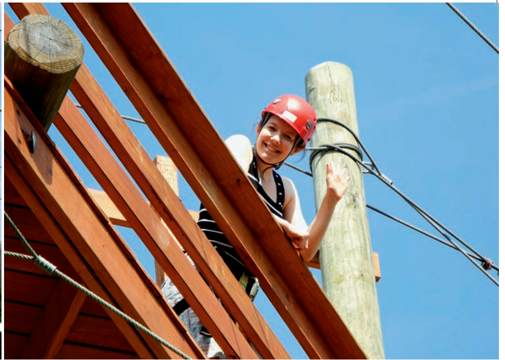
The author at Red River Gorge Zipline

Although the tour is enjoyable, it is also a workout. We have hills to ascend weighed down with at least 20 pounds of gear. The sun is hot above the trees, and adrenaline has a funny way of eventually tiring the body out.