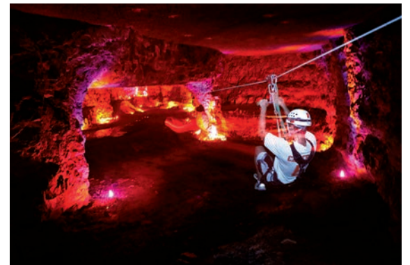
Louisville Mega Cavern

An added bonus of the Mega Zips tour: The temperature in the cavern is 58 degrees year-round, so it is a good option for escaping the summer heat. 🌧️